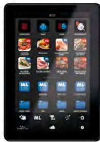
LCD 7" Touch Screen

AUTOMATIC INTERACTIVE COOKING TOUCH SCREEN CONTROLS